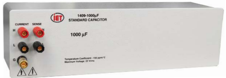
1409 Model, 1000 μF value