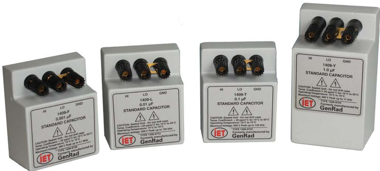
Various models of 1409 Standard Capacitors