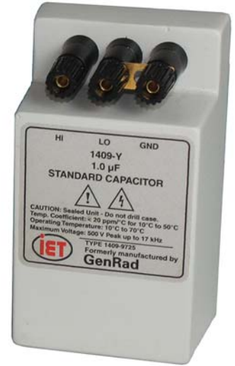
1409 1 \mu\text{F} Standard Capacitor