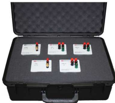
SRC-10-n Transit Case for n units (5 units shown)