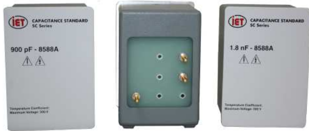
SCA-1nF-8588A Direct Connection