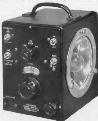
FIGURE 2. TYPE 631-A Strobotac

The strobotac may also be used to obtain highly accurate measurements of the slip of induction motors. For this purpose, the strobotac is controlled by the power-line frequency and the slip of the motor may be counted directly. A similar method can be used to observe hunting and transients in synchronous motors.