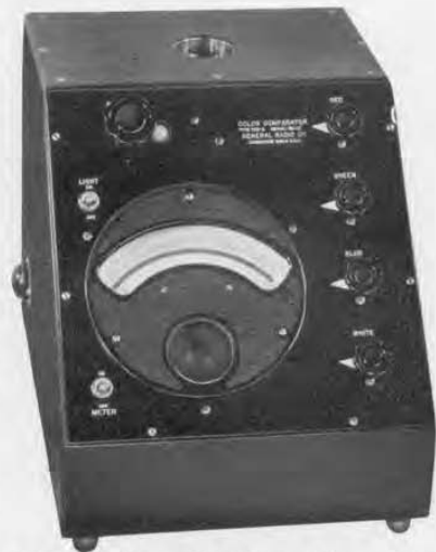
FIGURE 1. TYPE 725-A Color Comparator. Color intensity is indicated as a meter reading. Filters are shifted by means of the knob at the upper left. The pilot lamp indicates which filter is in position

Color matching in most industrial plants still depends upon the skill and the color judgment of an experienced operative unassisted by instrumentation. This method of matching is open to rather serious objections. In cases of disagreement there is no impartial