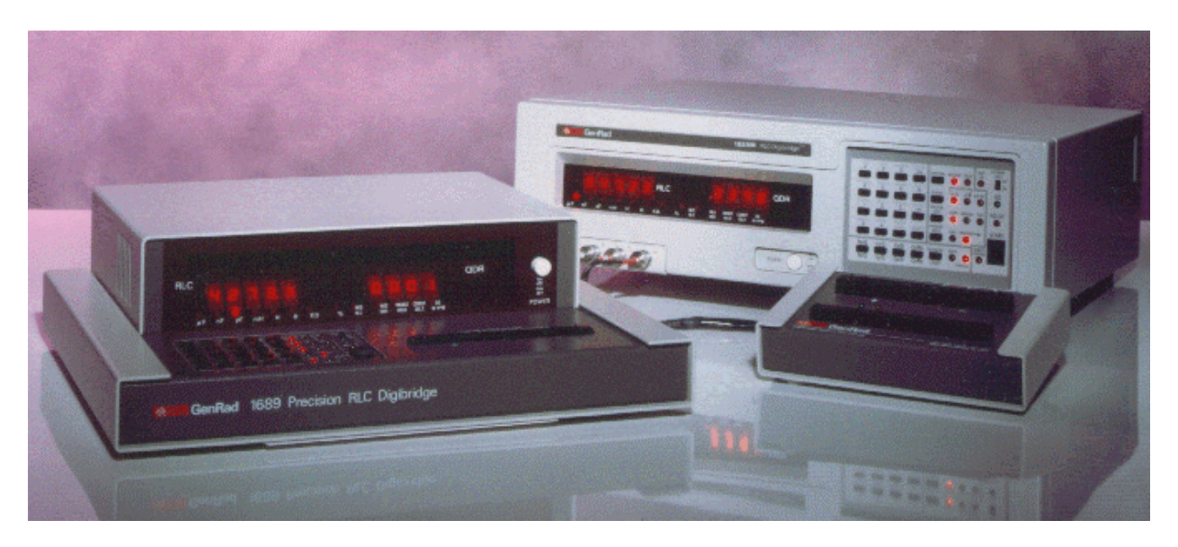
Figure 2: 1689 and 1693 Digibridges

Note that the circuit has been tested under a variety of conditions. All values given are conservative and will provide substantially improved protection, but we cannot guarantee that this protection will be good enough in all cases. In any event, both for safety of the operator and protection of the Digibridge, capacitors should always be discharged after a high voltage test.